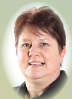
Dawn White Prompt